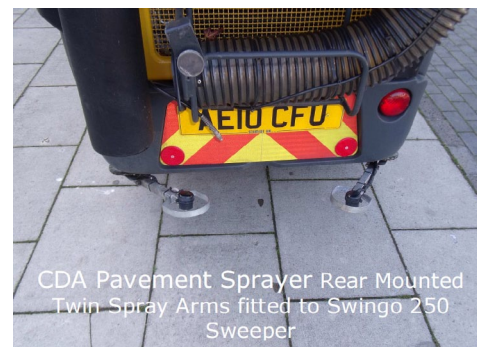
CDA Pavement Sprayer Rear Mounted Twin Spray Arms fitted to Swingo 250 Sweeper

Note: SprayCDA can offer operator training and certification on request.